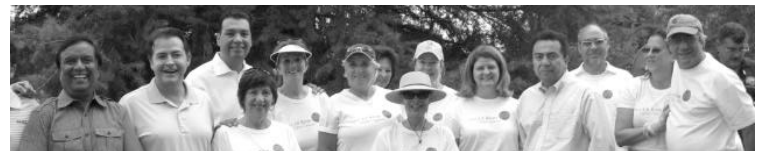
Members of Save LA River Open Space joined Friends of the LA River for the August 22, 2009 Los Angeles River clean-up event, along with State Senator Alex Padilla.

In addition, Assembly member Mike Feuer will address the state legislature's progress on water issues. Feuer recently attended a public forum (along with Studio City Residents Association affiliate Save LA River Open Space), which focused on solving California's water crisis. Feuer will address the urgent need to fix the fragile Sacramento-SanJoaquin Delta region, from which Southern California receives more than one-third of its water.